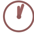
After Hours Games

Escape Tactic is the perfect option for corporate team building, church events, or just your own large group. We have multiple pricing options to fit your needs and can make rooms available to you before they're available to the general public.